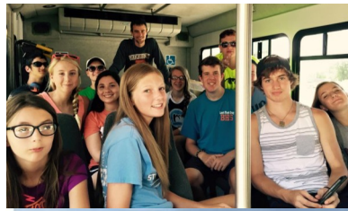
CAMP 2015 Bridgeport