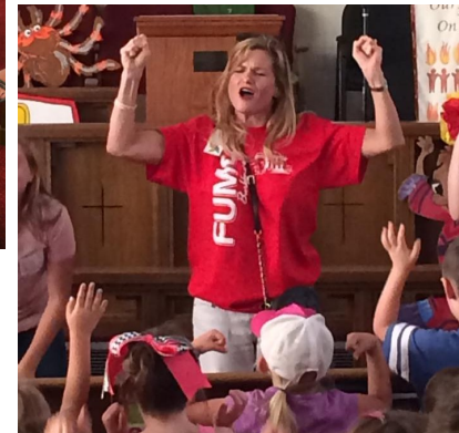
VBS MAKES A DIFFERENCE! THIS PICTURE FROM 2004